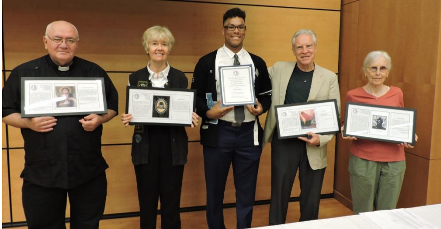
PCMNY Peacemakers and Young Peacebuilder 2019

It's time once again to nominate notable Peacemakers for our annual Awards Ceremony. As always, we are seeking those whose efforts, vision, and spirit lead us on the way to peace. One should be a person of faith whose peacemaking has reached people across the nation in his/her efforts to teach peace, make peace, and be peace. The other should be a person of faith whose work is helping to transform metropolitan New York into the City of God . Please nominate one or both who fit these descriptions, have inspired you, and will draw others to our cause. Send a paragraph for each to the PCMNY office by November 6 th . Designate if each nominee is for the national or local award. Tell us why you think he or she should be honored as a peacemaker. And please include contact information for your nominees. Send an e-mail message to info@nypaxchristi.org , and be sure to include all required information. Thanks!